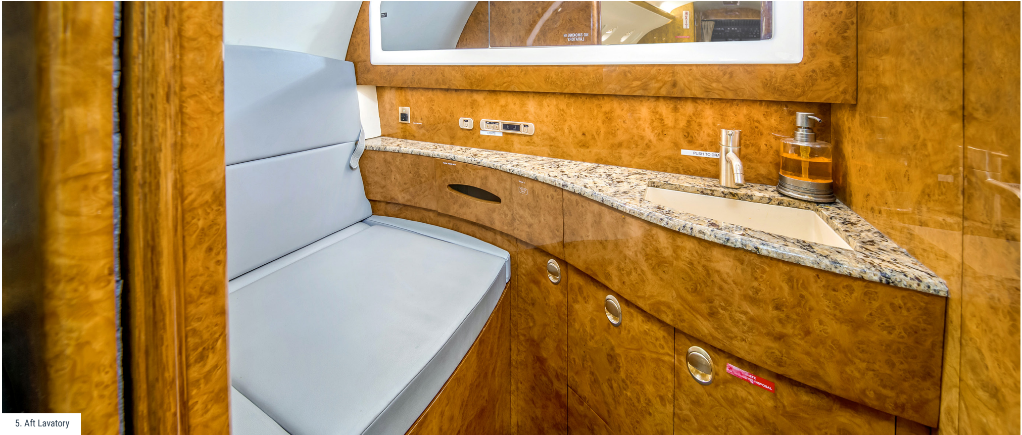
5. Aft Lavatory